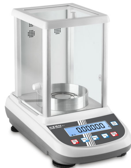
1 KERN ALJ 200-5DA with optional ionisor 2, see Accessories

Analytical balance range with large weighing capacities – now also with EC type approval [M] or available as semi-micro analytical balance